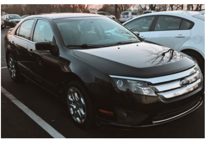
Mathilde's beautiful black Ford Fusion!

You will still need to complete payments at the DMV once you have the car and insurance, but if you just take one step at a time, everything will eventually be fine!