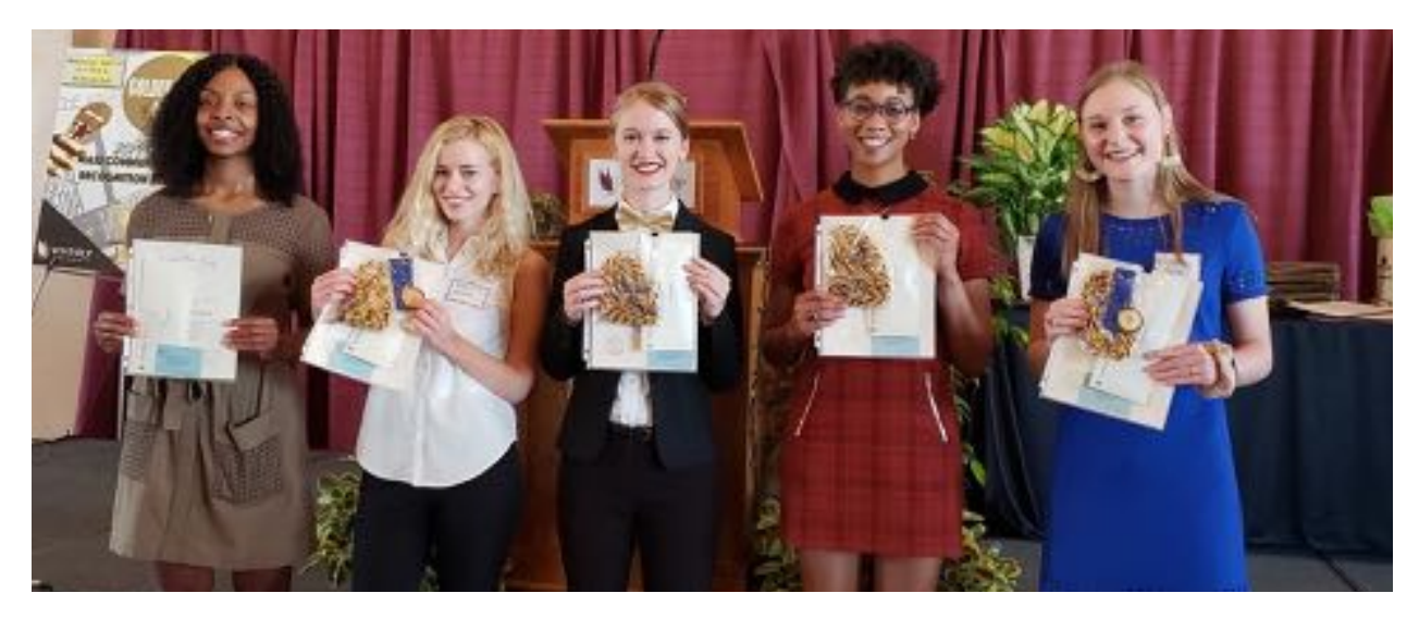
Five students stand in recognition of their induction into Kappa Tau Alpha.