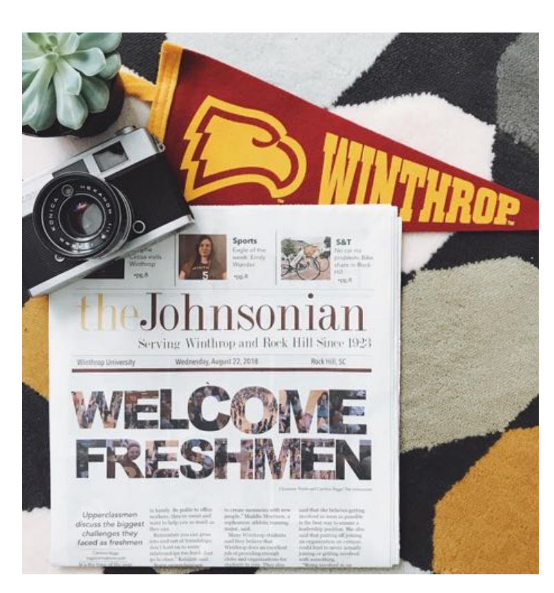
Follow The Johnsonian on Instagram, Twitter, and Facebook: @thejohnsonian

The staff meets twice a week to discuss current news and event on campus. It is published during fall and spring semesters with the exception of university holidays and exam periods. Each issue is released on campus every Wednesday.